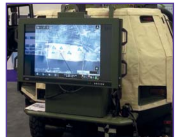
RD40 vehicle installation