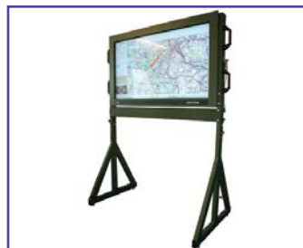
RD40 with stands