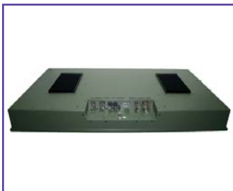
RD40 rear side